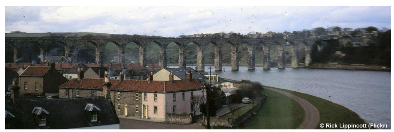
Royal Border Bridge over the River Tweed