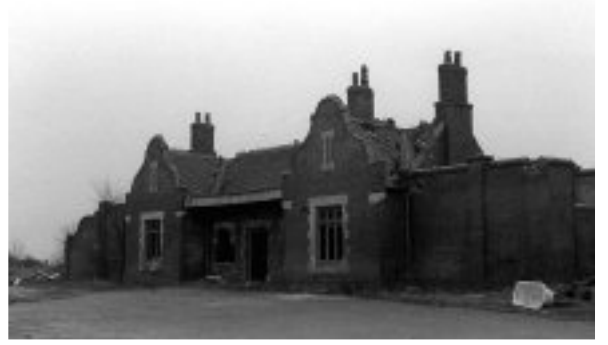
Godmanchester Station closed to passengers 15/June/1959

http://www.disused-stations.org.uk/g/godmanchester/index.shtml