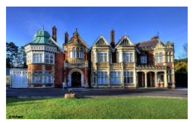
Bletchley Park Mansion