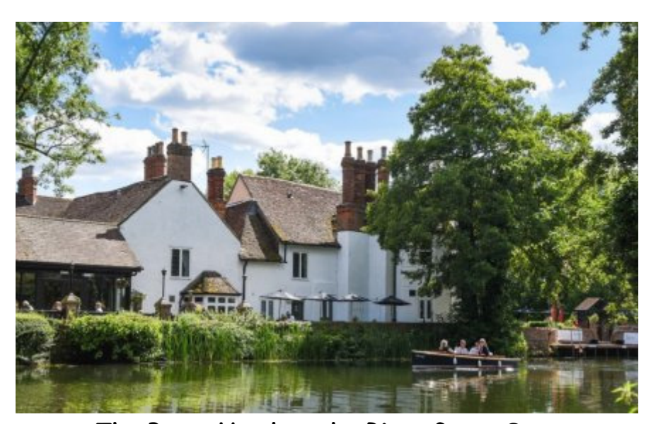
The Barns Hotel on the River Great Ouse

Remember, when you book for the Barn's Hotel tell them it's for the Stinson Group, as we have a reduced rate